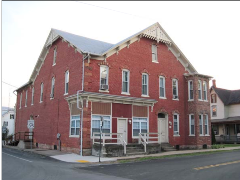
A recent view of the former Raudenbush Store in Laurelton. The store has since been converted into a multifamily dwelling.