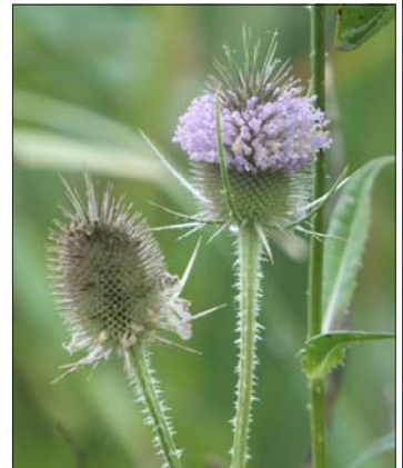
Photograph of Common Teasel

August is a very slow month for bird watching; breeding is over and much of their activity seems to be taking place in secret. As I was walking late in the month, I heard a group of Blue Jays calling back and forth and I realized I had rarely seen or heard them all summer long. It's funny how you don't even miss something until you are reminded like that. Blue Jays are common all winter long and can be quite boisterous, so you can't help but be aware of them, but during breeding season they virtually disappear. Another bird I had not seen all season this year was the Green Herons; I was just starting to wonder if I would see them at all this year. I sometimes see them in May or June and then not again until late August into September. I did finally see one criss crossing Penns