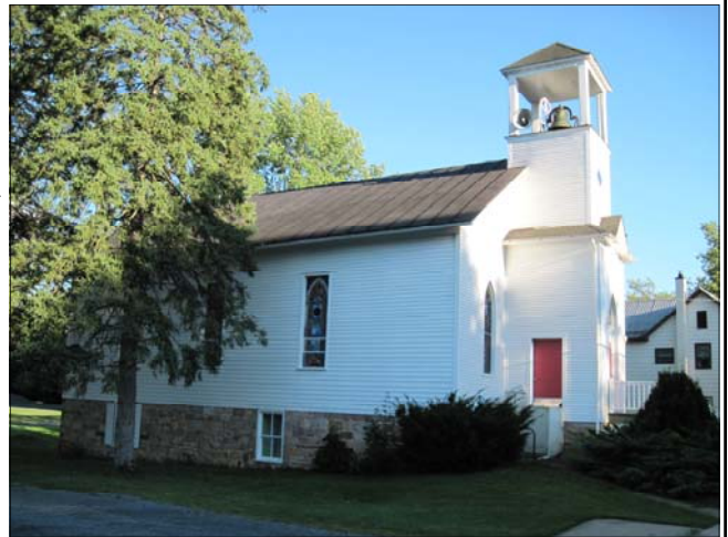
The Ebenezer United Church of Christ in Laurelton began when the Reformed congregation broke away from the Lutheran Church in 1876.

The Laurelton Lutheran Church located at 2360 Laurel Road was sold following the merger and significant alterations were made to the church as it was converted into a single-family dwelling.